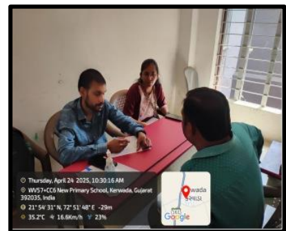
General Medical Check-up Camp Conducted at Kerawada Primary School