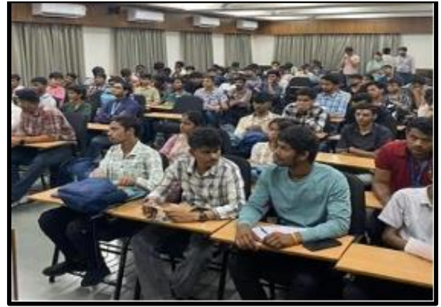
Expert Discussion on Civil Engineers and Environmental Sustainability On Earth Day