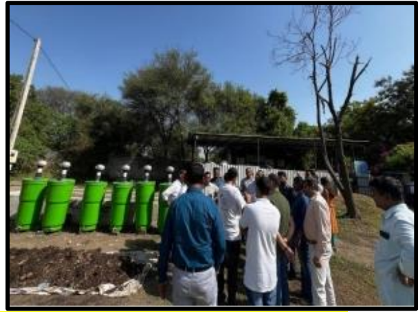
Earth Day Plastic Waste Disposal Awareness Program by RCBG and Kachre Se Azadi Foundation