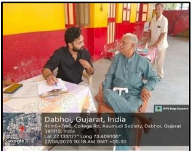
General Health Check-up Camp Improved Dabhoi Community Wellness