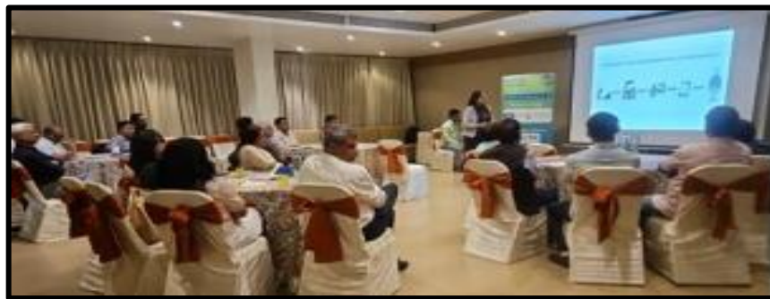
Sustainable Building Practices Lecture at ISHRAE Technology Day 2025