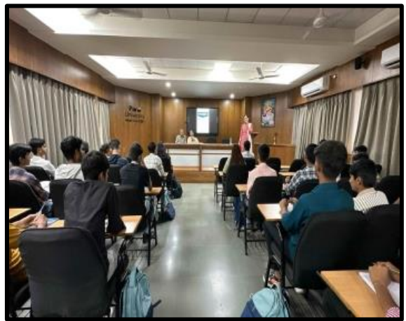
Electrical Department and Rotary Club of Baroda Greens Present Energy Conservation Expertise