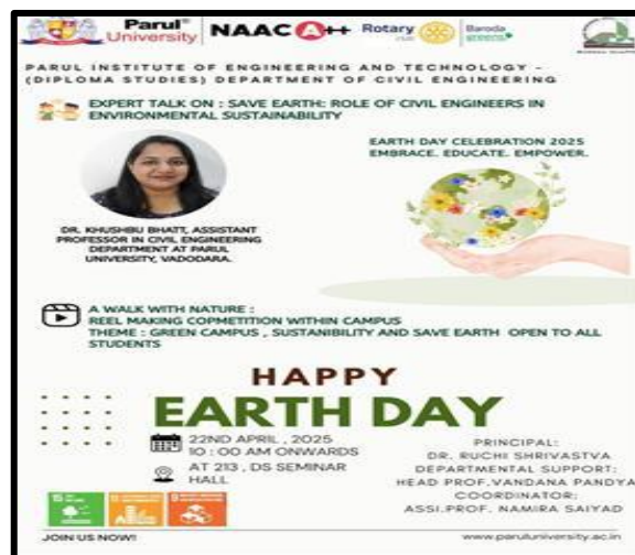
"A Walk with Nature" Earth Day Reel-Making Competition Inspired Students

Participants enthusiastically captured and showcased various green initiatives across the campus, including tree plantations, water-saving systems, and waste segregation units. The competition highlighted the collective efforts being made toward building a more eco-friendly and sustainable campus.